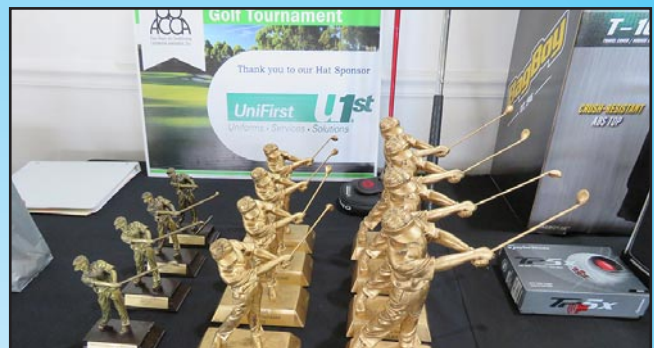
Trophies... Trophies... Trophies