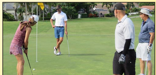
Putting for Pars