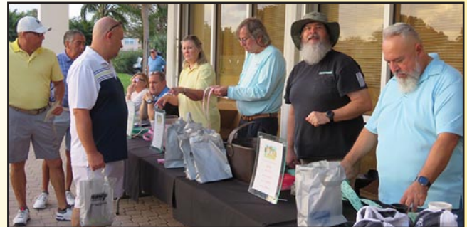
The registration process included a tournament hat and goodie bag