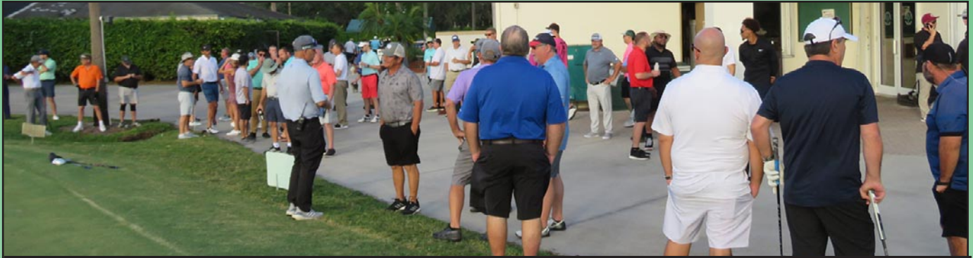
Winston Trails Golf Pro going over course rules before the tournament starts