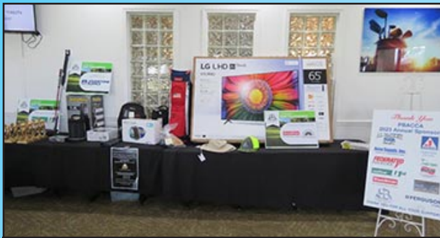
THANK YOU Sponsors!