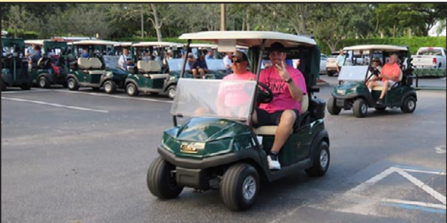
Golfers drive off to their assigned holes to start the tournament