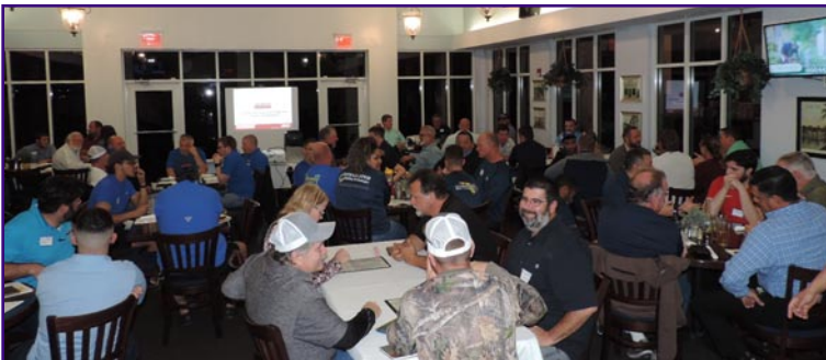
It was great to see everyone in person as it was an exciting night full of good food provided by the Beach Club in Lake Worth